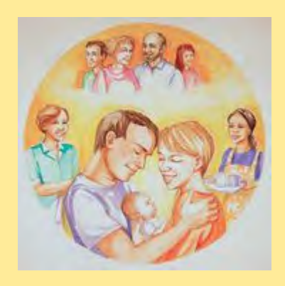
Once the baby is born, the family is supported by extended family and community.