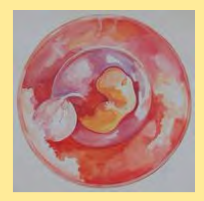
In the womb, the embryo is supported by the amnion and the chorion.