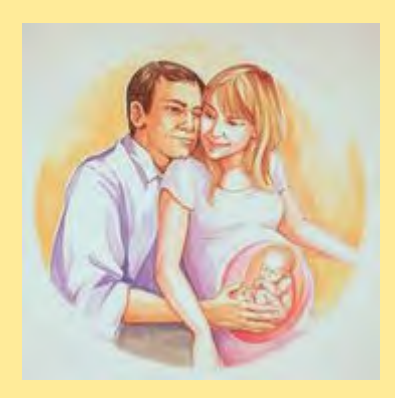
The baby is then supported by the mom and her partner.