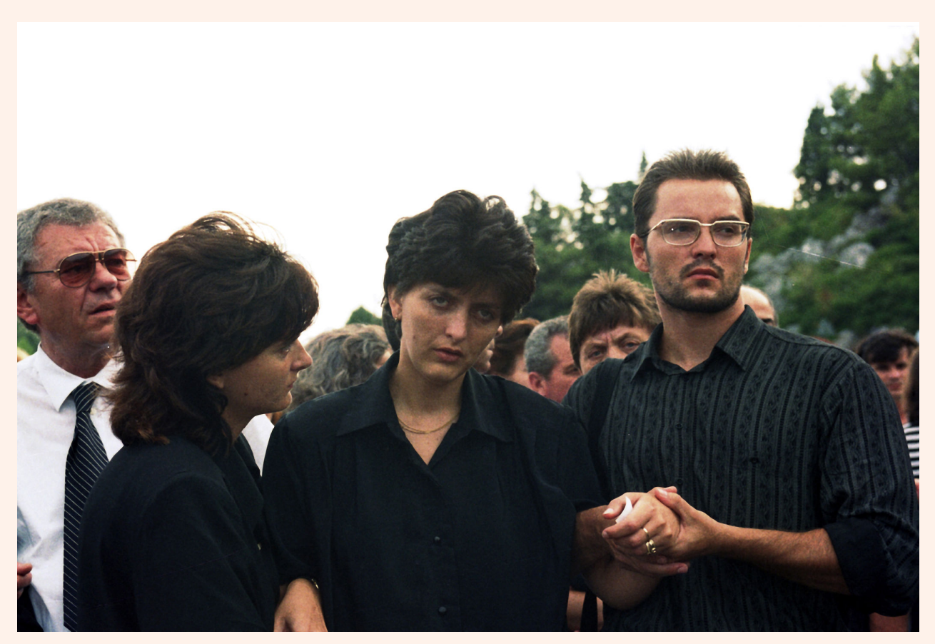
Somatic Psychotherapy Today | Fall 2015 | Volume 5 Number 4 | page 40

Caroline met with two of the women from the original study, which was conducted in 2010. One lovely lady had maintained her outgoing confident character that grew over those initial two weeks in 2010. It is perhaps significant that she had continued to use EFT and heart breathing whenever she felt under stress, saying she goes into her garden to tap whenever she finds things